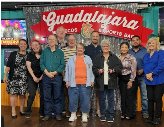
Lunch after Mass